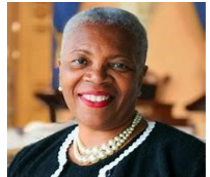
Senator Paula Hicks Hudson